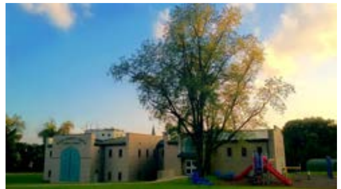
Left image: Pittsburgh Sikh Gurdwara;